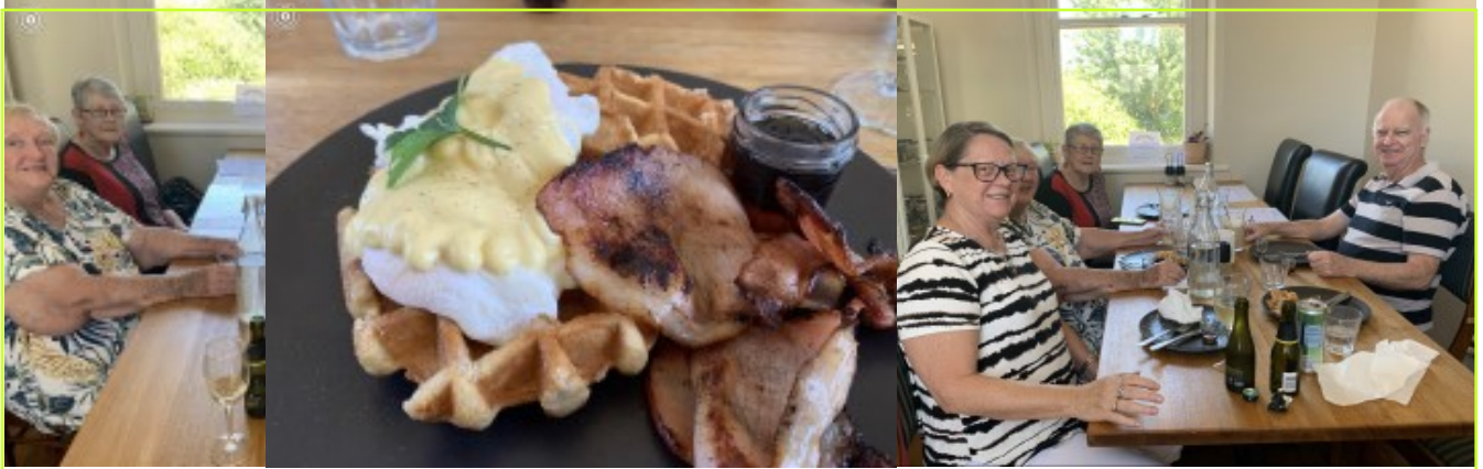
Lunch at the Gatehouse